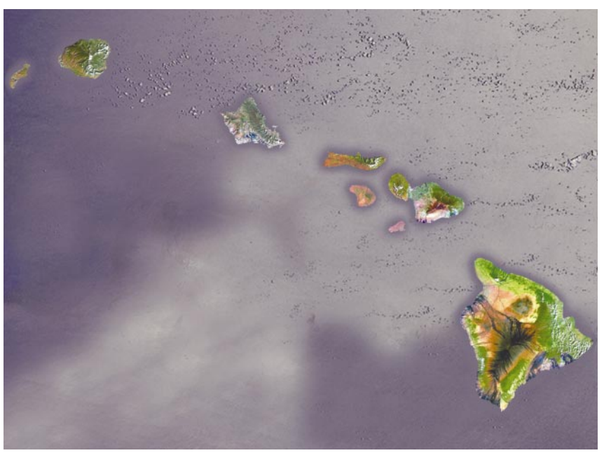
Chain reaction: the Hawaiian Islands stretch away from the geophysical hotspot that formed them. Currently, the hotspot is centred just southeast of the Big Island (bottom right).

The volcanic processes that gave rise to the Hawaiian Islands are relatively well understood. But the plume that feeds the hotspot remains shrouded in mystery. Researchers want to know the plume's width, the temperature of the rock rising up through it, and more about its geochemical composition. Most fundamentally, they want to know how deep in the Earth's mantle are the plume's origins. "The mantle has been like a mysterious black box," says