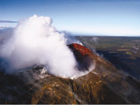
Taking on the mantle: by deploying 35 LC2000 seismometers (left) around Hawaii, the PLUME team hopes to gain insight into the processes powering volcanoes such as Kilauea (above).

prepare for action, supporters of the NSF's Ocean Mantle Dynamics Science Plan must also make themselves busy. For if they are to gain the maximum benefit from their proposed experiments, they need to get funding in place without delay. They are looking for some $20 million to build 350 ocean-floor seismometers, plus running costs of about $10 million a year.